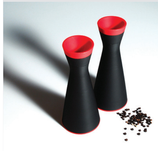
M3 Salt and Pepper Shakers